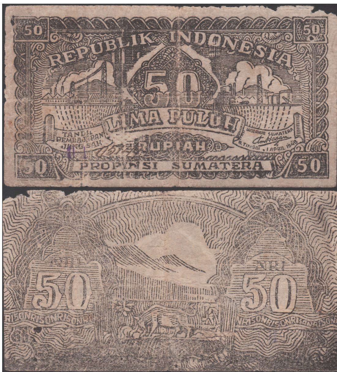
RH764a – from a private collection

Obverse and reverse printed in black. Obverse comparable to RH763, but reverse with different design with “NRI” above the number 50 and the picture of a bull in stead of the law text.