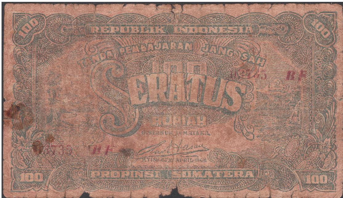
RH766a – from a private collection

Obverse and reverse printed in blue/green.